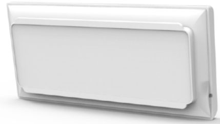
P29215 Rear View