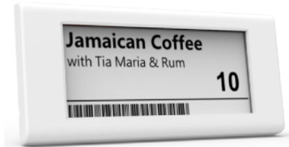
P29205 Front View