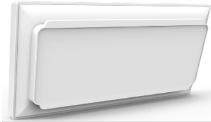
P29205 Rear View