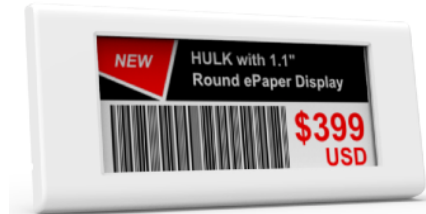
P29215 Rear View